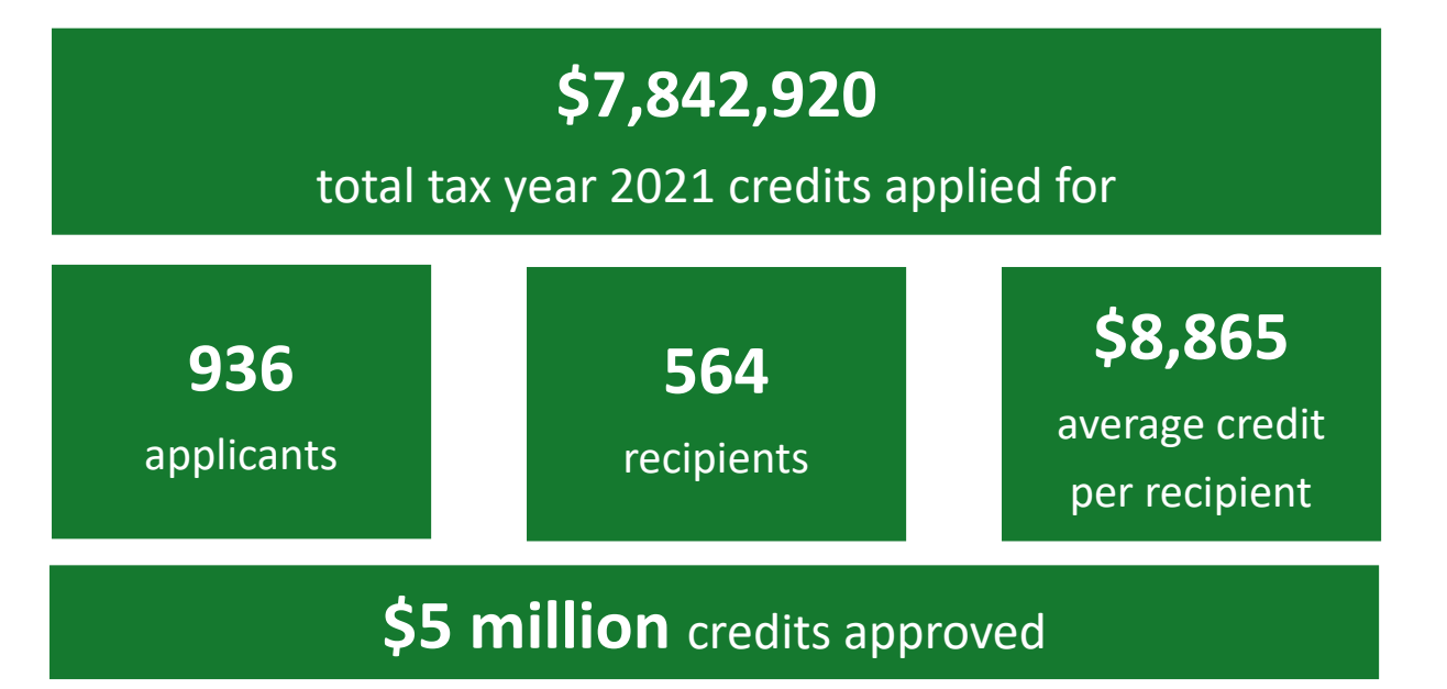
Data provided by the SCDOR.

When the parent files SC income taxes, the Parental Tax Credit amount is used to complete Form I-361.